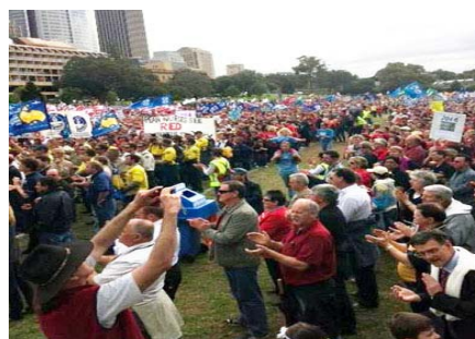
30,000 public service workers attend the Day For Action Rally